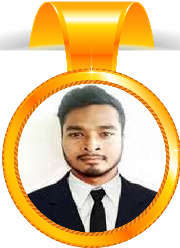
KINGSUK BAG IEC2018001