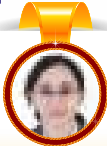
BRONZE ARYA KRISHNAN ICM2017501