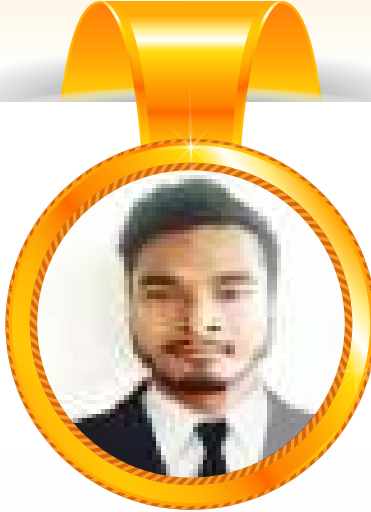
GOLD KINGSUK BAG IEC2018001