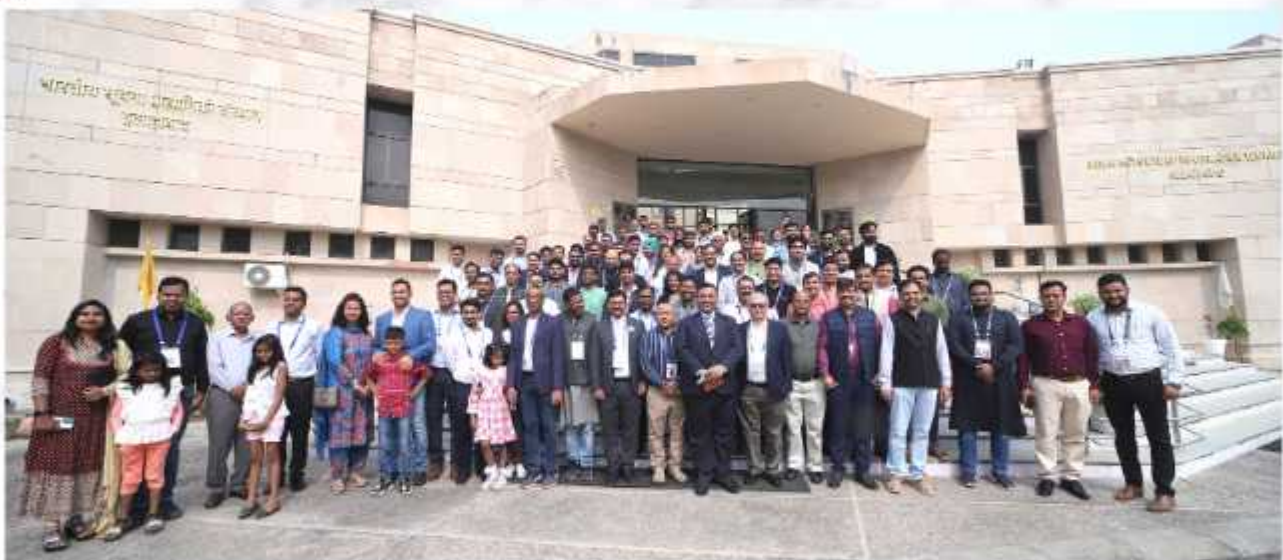
Venue: IIIT Allahabad, Prayagraj