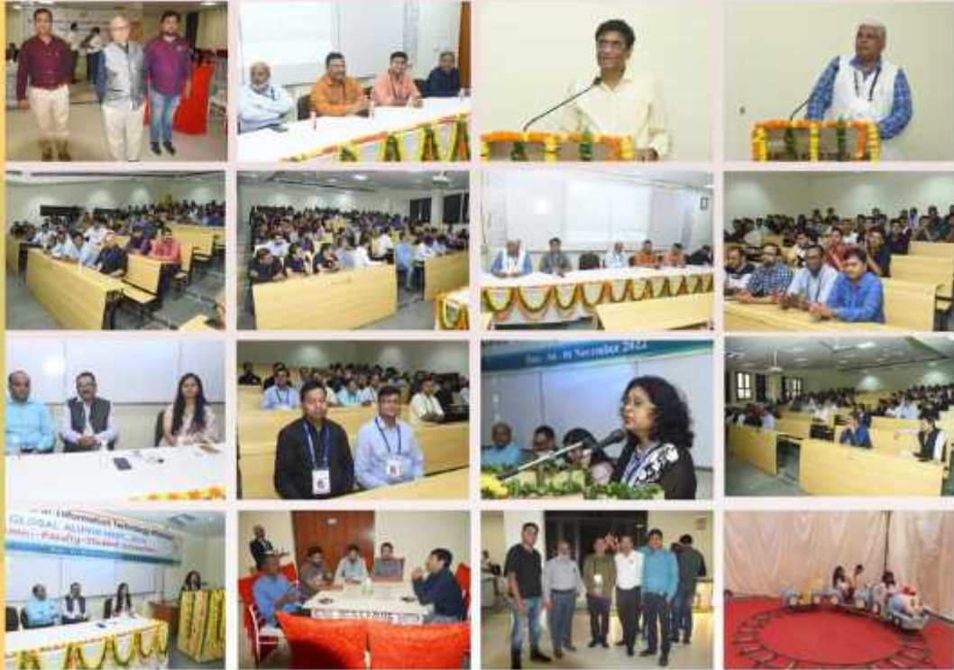
Venue: IIIT Allahabad, Prayagraj